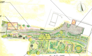
New Bridge 2009